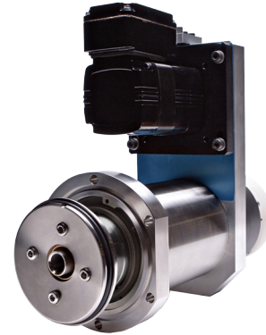
Patented MM-Series Side Mount Rotary Cathode